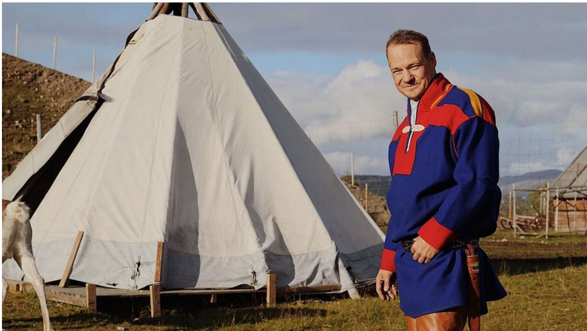
Sami Siida, Alta

A visit to Alta is also an opportunity to connect with the region's deep cultural roots. For thousands of years, the area has been a meeting place for indigenous Sámi people, and today, visitors can engage with Sámi traditions and way of life. Just outside the town, guided experiences offer insight into Sámi culture, from sampling traditional food to learning about reindeer herding and history. These encounters provide a meaningful connection to the Arctic's past and present.