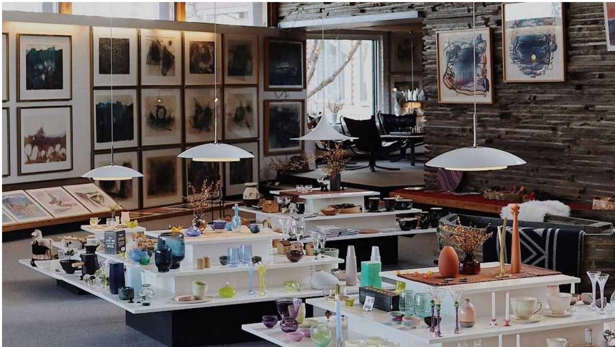
Juhls' Silver Gallery, Kautokeino

Alta is also a great starting point for discovering more of the Arctic, offering easy bus and ferry routes to Hammerfest, Nordkapp, and Sapmi. In Hammerfest, the world's northernmost town, you can explore the rich history of the region at the Museum of Reconstruction, dedicated to the post-war reconstruction of northern Norway. A bus ride takes you to Nordkapp, where you can stand at the iconic North Cape and enjoy the view over the ocean from Europe's northernmost point. Lastly, you can learn more about the Sámi culture in Kautokeino with a visit to Juhls' Silver Gallery, showcasing exquisite craftsmanship deeply rooted in Sámi traditions.