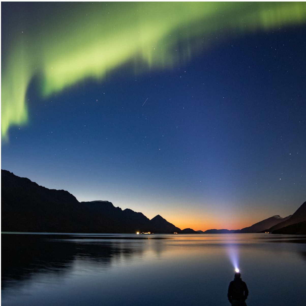
Northern light, Alta

Alta, known as the 'City of the Northern Lights,' is a popular destination for those seeking to experience this unique Nordic wonder. Its location, perfectly situated between the sea and the vast Finnmarksvidda plateau, offers exceptional conditions for viewing the aurora. From late November to mid-January, the polar night brings extended darkness, making Alta one of the world's top spots to witness this natural phenomenon.